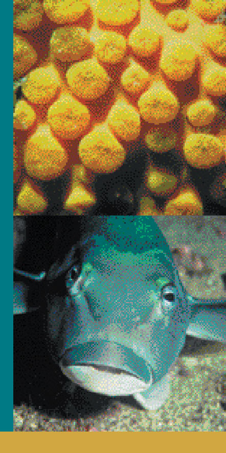
Marine Protected Areas Policy and Implementation Plan